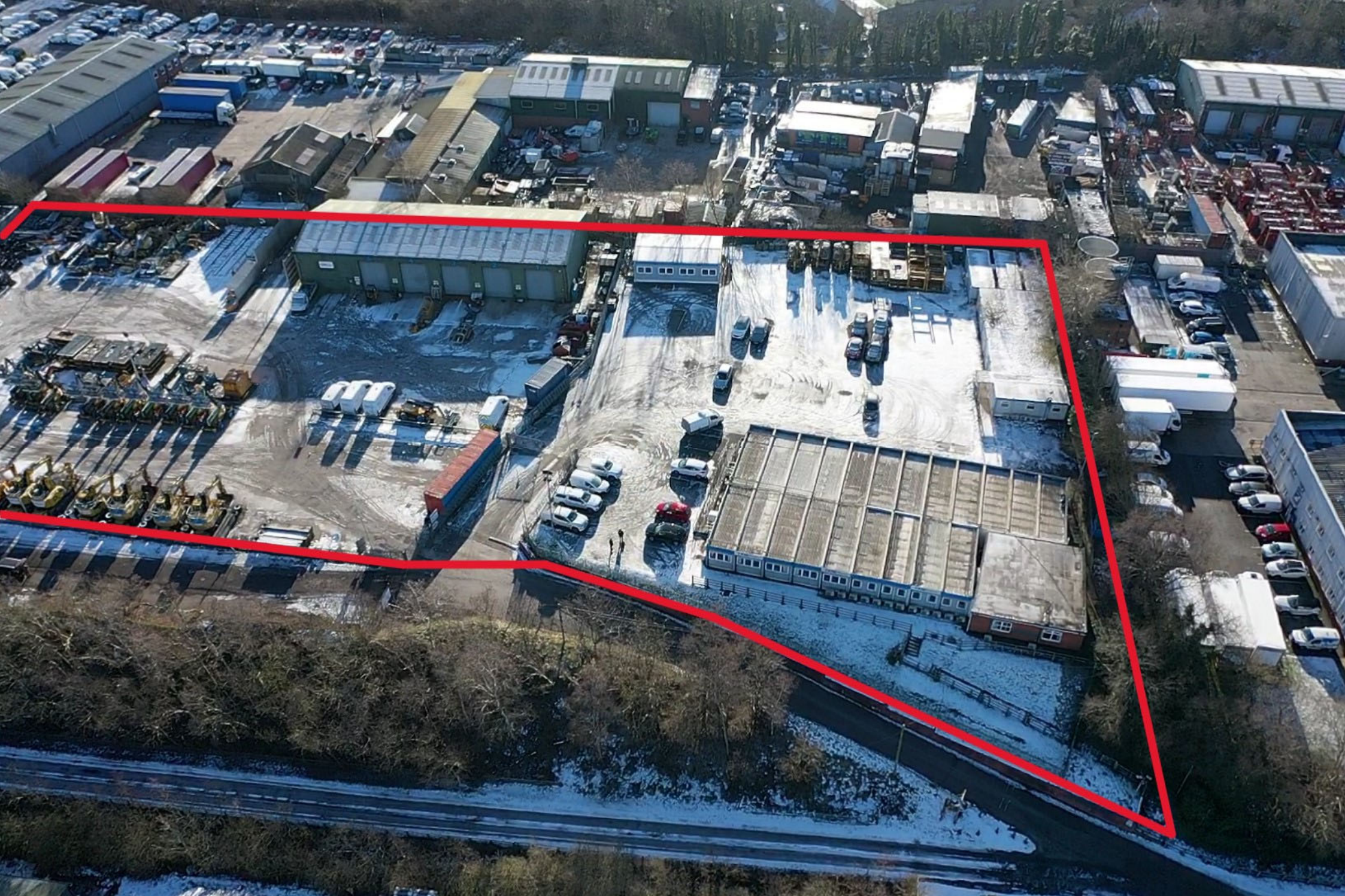
YARD 1 – PARK LANE BUSINESS ESTATE