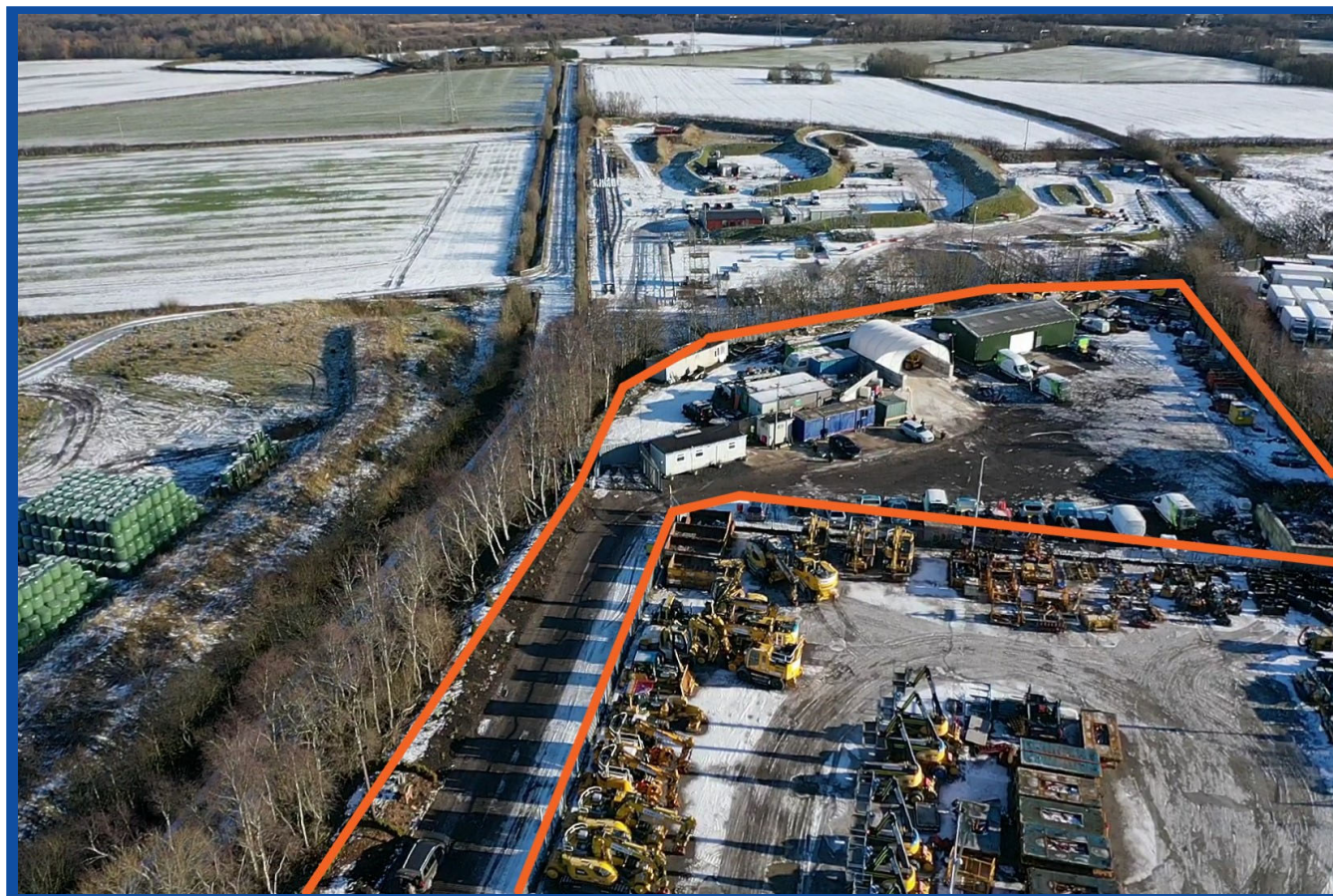
YARD 4 - PARK LANE BUSINESS ESTATE

Current Occupiers Yard 1 – TXM Plant in administration Yard 2 – McVeigh Parker Yard 3 – Carnell Yard 4 – Nurture Landscapes Limited