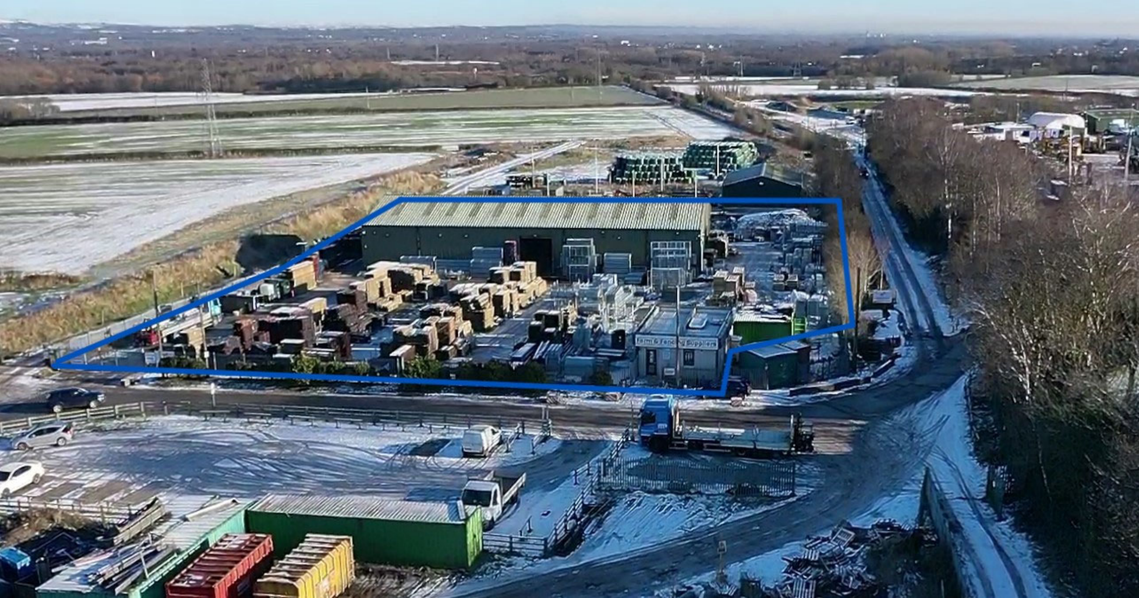
YARD 2 – PARK LANE BUSINESS ESTATE