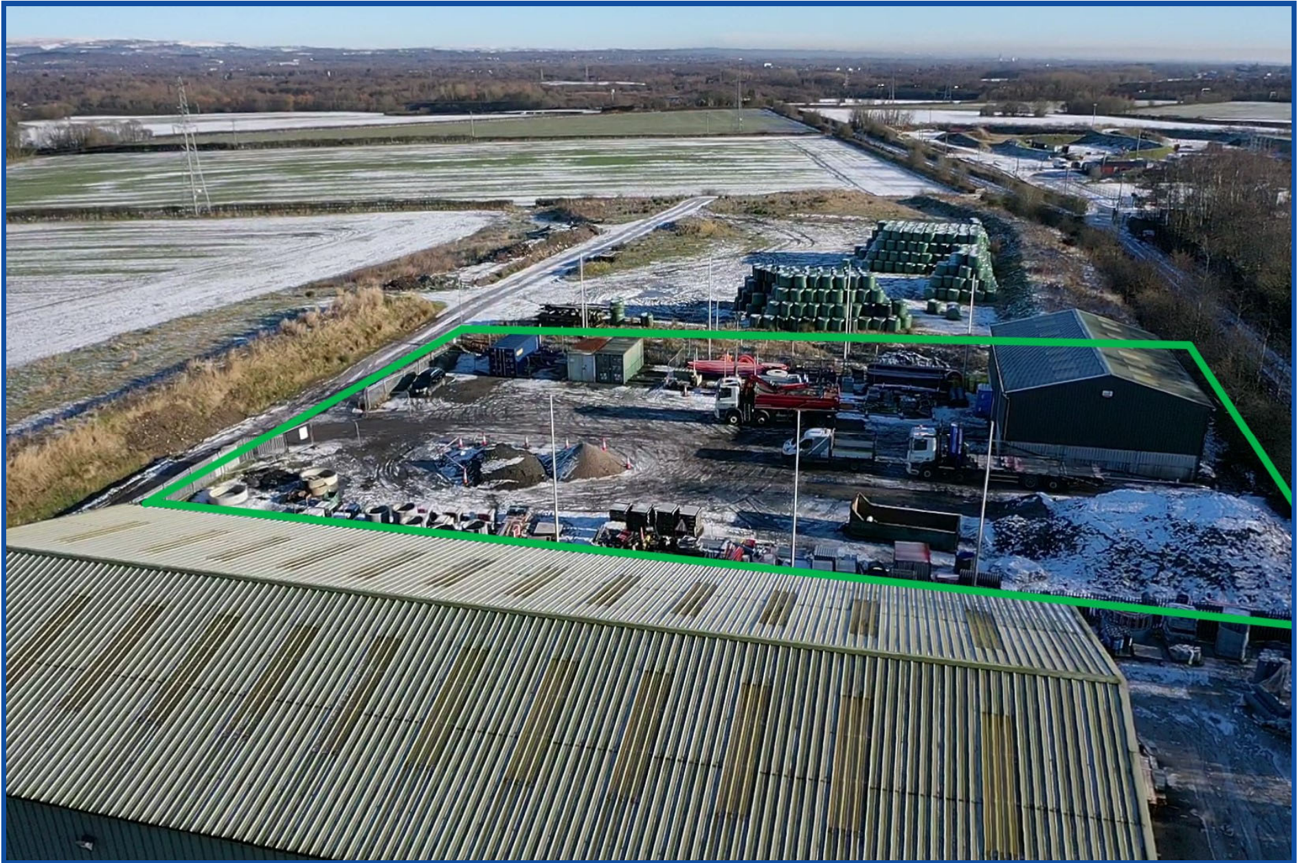
YARD 3 – PARK LANE BUSINESS ESTATE